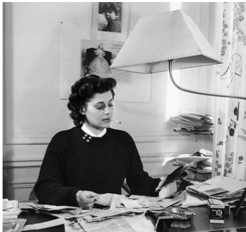
Françoise Giroud à son bureau, années 30. Nicknamed an Amazon of the Republic, Giroud modernized journalism on women's social and political issues by focusing on questions about female sexuality and pleasure, contraception, celibacy, and material independence. Audacious, sometimes indiscreet portraits of her era's stars also made her indispensable on popular culture.